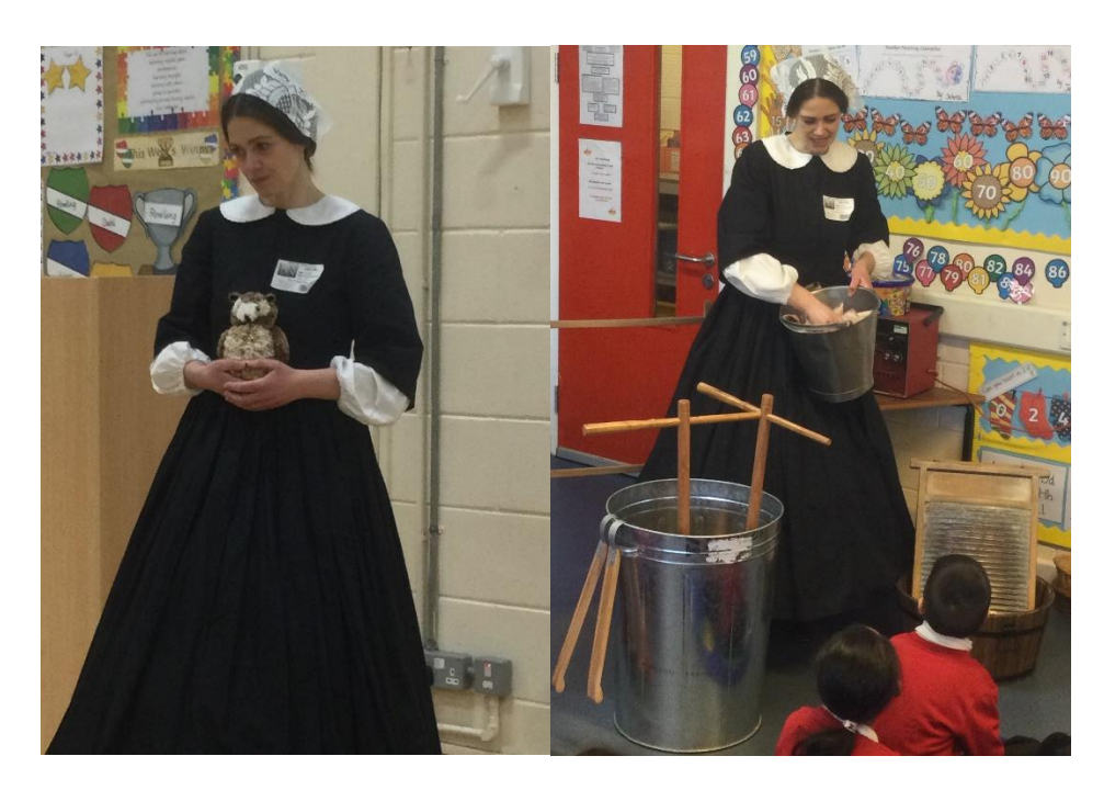
Year 6 Workshop - World War II

"I loved making the herbal medicine. I used rosemary and sage."